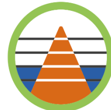
Elevation and Depth