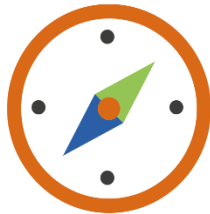
Global Geodetic Reference Frame