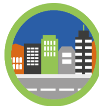
Buildings and Settlements