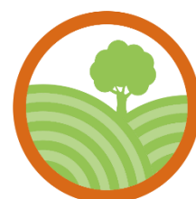
Land Cover and Land Use